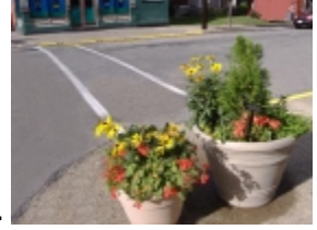
Decorative flower pots on a Bellevue corner.

If you are not already aware of the Bellevue Neighborhood Association you can find out more about applying for a Beautify Bellevue Grant, see events on the calendar, volunteer, and subscribe to the free newsletter. Start at their home page at bna-ky.com