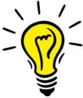
Illumination Youth Group