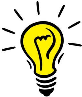
Illumination Youth Group